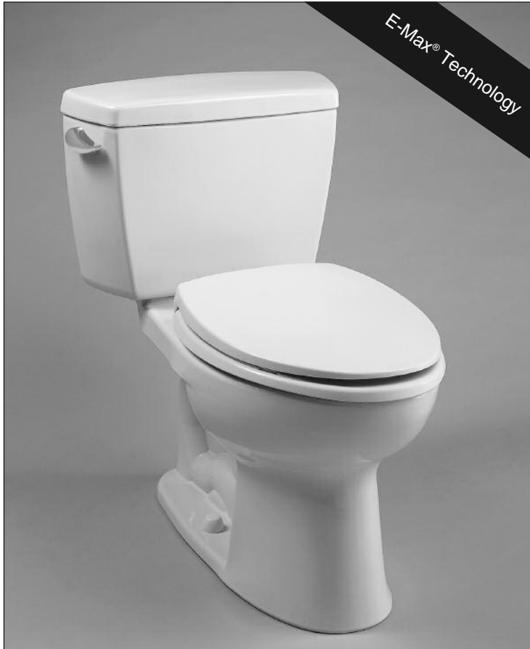
CST744EG - Eco Drake® Toilet SS114 - SoftClose® Seat